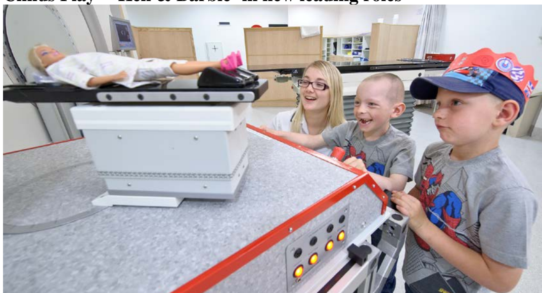
Unique working model gives young patients a doll-sized view of complex cancer treatment machines

Popular children’s toys “Barbie” and “Ken” have a unique new accessory thanks to the efforts of engineers and radiotherapists in Bexley Wing - a realistic scale model of a linear accelerator cancer treatment machine.